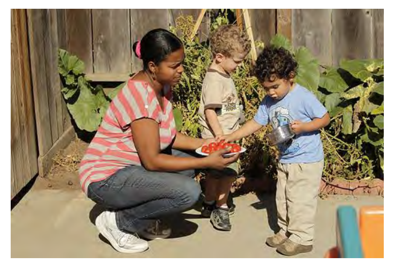
The children shared the vegetables in the garden that they helped harvest.

The children were happy because their families "attended" the school. It was touching to see it. Families warmed up to the environment. Their confidence in the program grew and they were happy to have their children in the program.