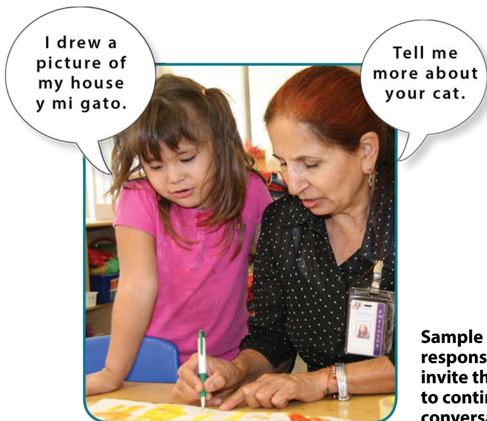
Sample adult responses that invite the child to continue the conversation